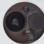
Cylinder head before P.i. treatment.