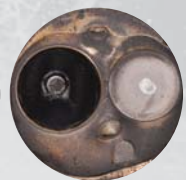
Cylinder head after one P.i. treatment.