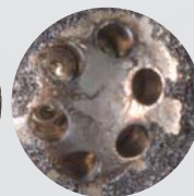
Injector after one P.i. treatment.